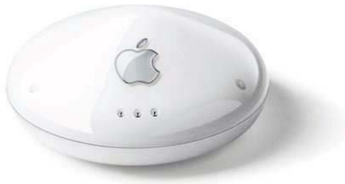
Figure 2 This an AirPort BS made by Apple. AirPort implements the IEEE 802.11b standard