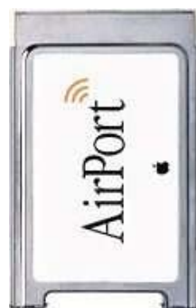
Figure 1 A laptop computer can become an MS by installing a PCMCIA card implementing the IEEE 802.11b standard. The above card is made by Apple