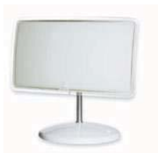
Figure 4 In typical use, ExtendAIR Direct antenna increases the effective range of AirPort to approximately 150m with a 70° beam width of coverage. Optimal performance will be achieved through positioning of the antenna in line-of-sight of the target clients or coverage area